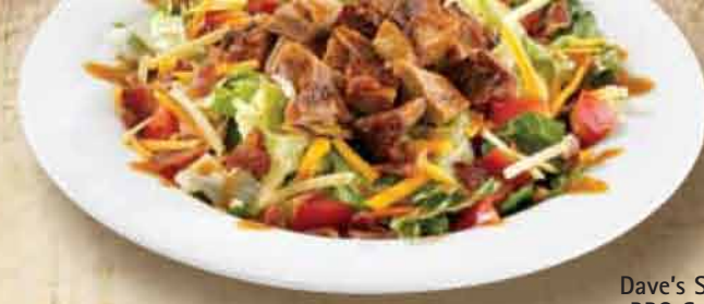
Dave's Sassy BBQ Salad

©2012 Famous Dave's of America, Inc. 9/12 Salinas/Reno/Redding