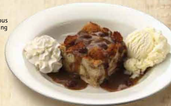
Dave's Famous Bread Pudding

Cool and tangy with a house-made graham cracker crust. 6.99