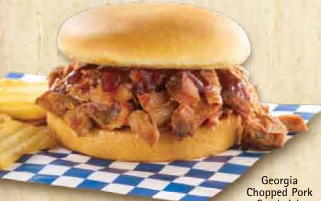
Georgia Chopped Pork Sandwich

Our sandwiches are served with spicy Hell-Fire Pickles and your choice of one side. Order yours "Memphis-style" and for just 99 cents we'll top your 'que sandwich with Creamy Coleslaw.