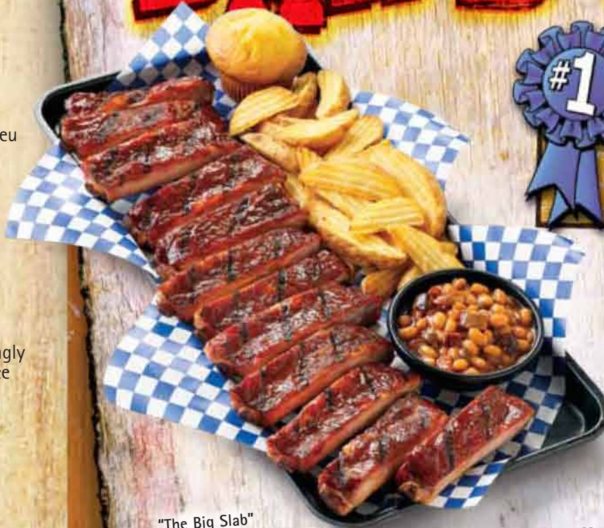
"The Big Slab"