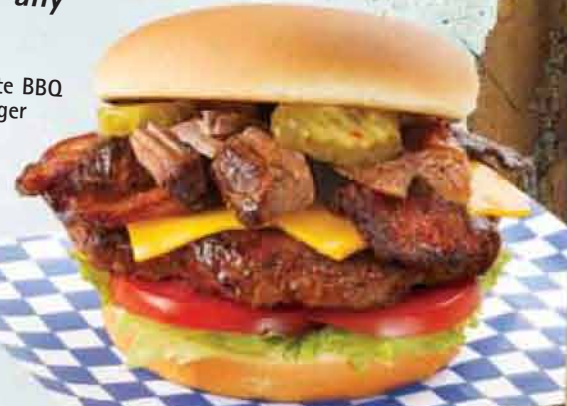
Ultimate BBQ Burger

A juicy ground beef patty beneath a pile of Georgia Chopped Pork with two strips of jalapeño bacon, melted sharp American cheese and our signature Beam & Cola BBQ sauce. 10.99