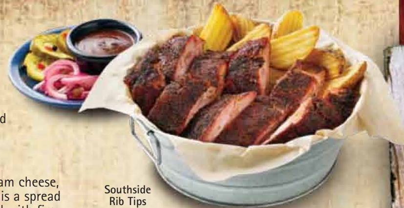
Southside Rib Tips

**These sides are a tasty 100 calories or less.