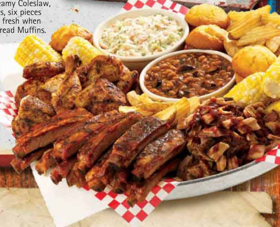
All-American BBQ Feast

Feast for Two All the flavor, but half the size of our All-American BBQ Feast. Served family-style for 2-3. 41.99